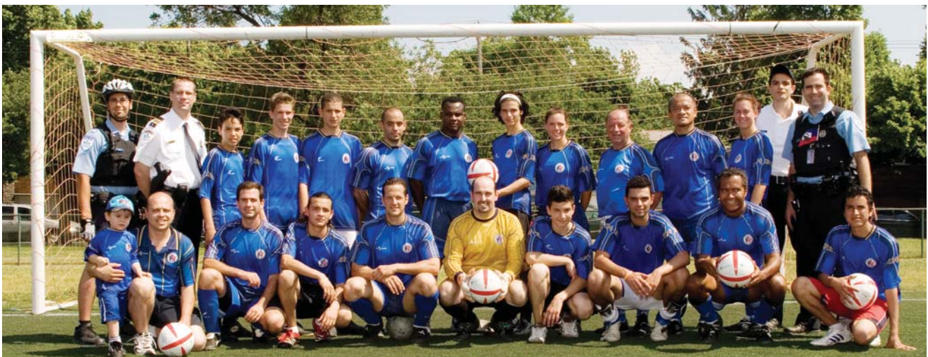
Soccer festival in the Borough of Bordeaux-Cartierville.