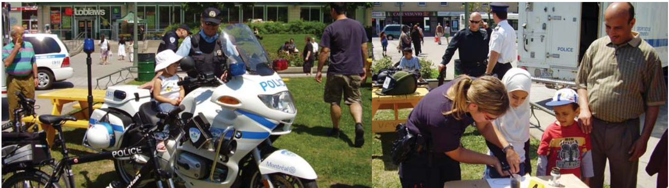
Children meeting police officers in Parc-Extension.

The SPVM firmly believes that public safety is the result of many different factors and that by understanding the daily reality of the people in every neighbourhood and explaining our own role and place in life in Montréal we can uphold peace and security for everyone and work together toward improving the quality of life of all Montrealers.