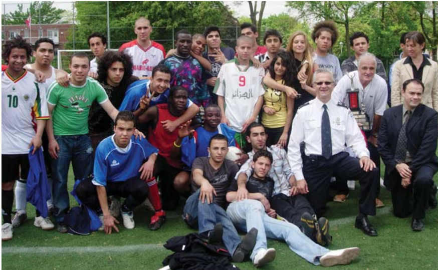
Students from École Marie-Anne taking part in the Soccer à coeur project.

Every year Montréal welcomes thousands of newcomers in search of a place where they can live peacefully and fulfil their potential. Immigration changes the face of Montréal, and the SPVM must constantly adapt to this changing reality.